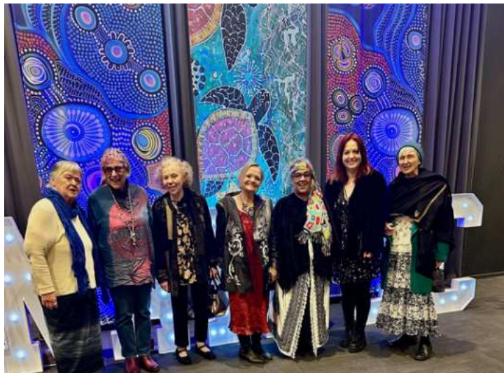
More SWAN women having a ball in front of magnificent First Nations artwork.