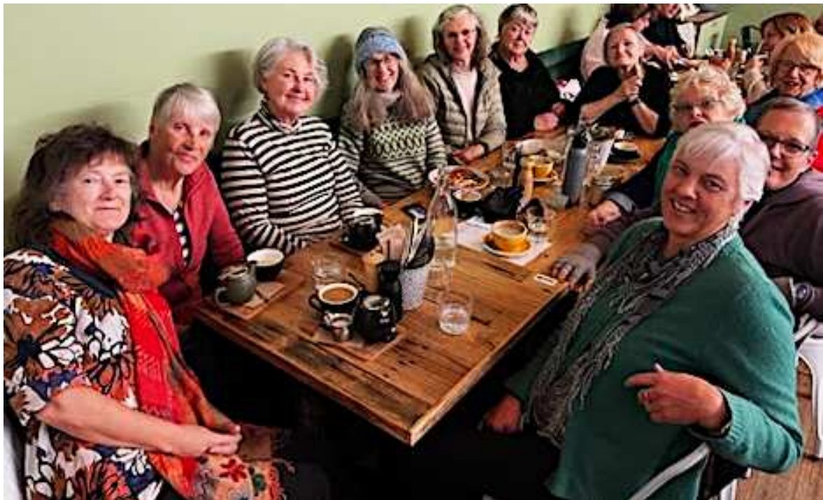
It was warm and cosy inside!