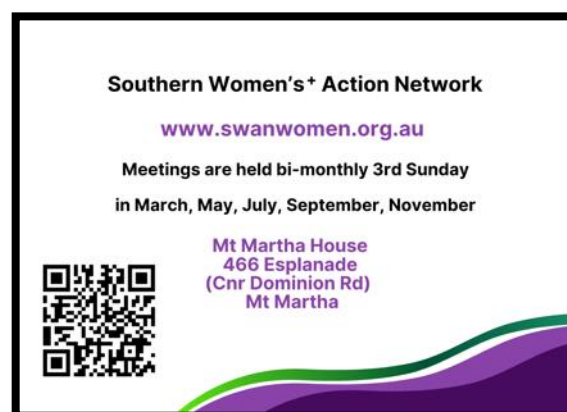
Our new Postcard (L: front, R: back) and A4 Poster