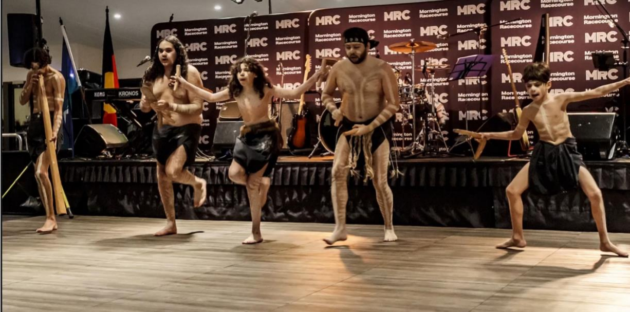
Traditional Dance group at Nairm Marr Djambana NAIDOC WEEK Dinner Dance

Over 370 people attended the NAIDOC Dinner Dance at Mornington Racecourse on Saturday 1 July. This joyous, celebratory event was hosted by Nairm Marr Djambana Aboriginal Gathering Place. Participants were entertained by the traditional dance troupe, 'Bantok Tati', accompanied by the melodious, rhythmic sound of the Didgeridoo: https://www.casey.vic.gov.au/events/bandok-tati-digital-story-launch . They then danced well into the night to more contemporary music provided by 'Rusty Nails'.