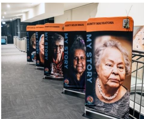
My Story Photo Exhibition at Nairm Marr Djambana

On 3 July two moving NAIDOC Flag Raising events were conducted in the Frankston – Mornington Peninsula area. These important annual activities included a Welcome to Country and smoking ceremony conducted by the Bunurong Land Council. The first event was held at Nairm Marr Djambana followed by the launch of the Elders Photo and Story Exhibition and a delicious morning tea prepared by Djambana Catering. The second event was held at Willum Warrain Aboriginal Gathering Place, following which participants enjoyed the chance to yarn and share stories over afternoon tea.